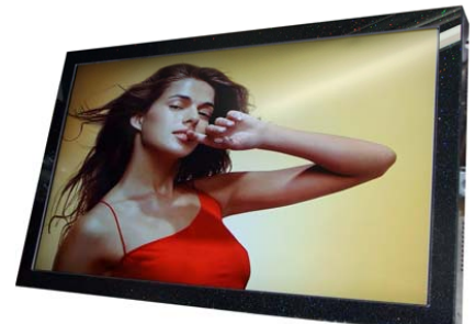
Black metal pearl bezel front frame