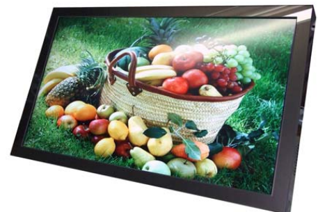
Black pearl bezel front frame

Model:R32HD6S -32inch size 16:9 wide LCD panel -LCD panel resolution 1366x768 - Slim size : 63(Depth)mm -Support play for Full HD Movie/JPG file -Auto play for Movie or Graphic file select -Select for front frame bezel -Support SD(SDHC) memory card -play file size MPEG1/2/4,H.264decode,up to 1080P(1920*1080-Full HD) RM/RMVB decode, RM/RMVB up to 720P(1280*720) HD Photo up to 6000*6000