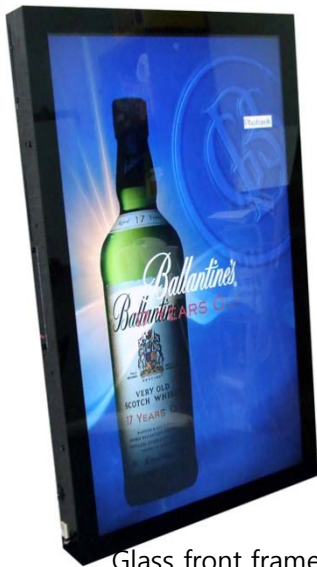
Glass front frame

Model:R32HD6S -32inch size 16:9 wide LCD panel -LCD panel resolution 1366x768 - Slim size : 63(Depth)mm -Support play for Full HD Movie/JPG file -Auto play for Movie or Graphic file select -Select for front frame bezel -Support SD(SDHC) memory card -play file size MPEG1/2/4,H.264decode,up to 1080P(1920*1080-Full HD) RM/RMVB decode, RM/RMVB up to 720P(1280*720) HD Photo up to 6000*6000