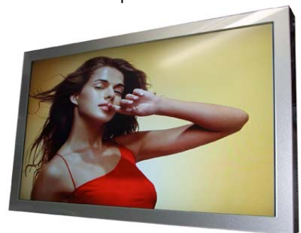
Silver pearl bezel front frame