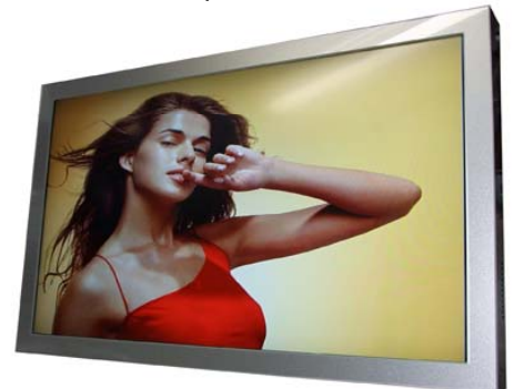
Silver pearl bezel front frame