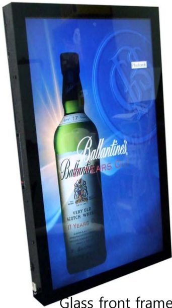
Glass front frame

Model:R32HD6S -32inch size 16:9 wide LCD panel -LCD panel resolution 1366x768 - Slim size : 63(Depth)mm -Support play for Full HD Movie/JPG file -Auto play for Movie or Graphic file select -Select for front frame bezel -Support SD(SDHC) memory card -play file size MPEG1/2/4,H.264decode,up to 1080P(1920*1080-Full HD) RM/RMVB decode, RM/RMVB up to 720P(1280*720) HD Photo up to 6000*6000