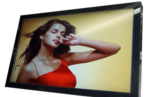
Black metal pearl bezel front frame