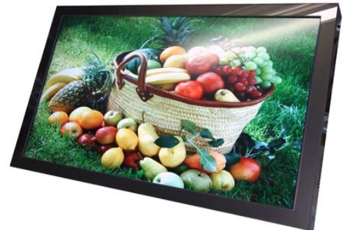
Black pearl bezel front frame

Model:R32HD6S -32inch size 16:9 wide LCD panel -LCD panel resolution 1366x768 - Slim size : 63(Depth)mm -Support play for Full HD Movie/JPG file -Auto play for Movie or Graphic file select -Select for front frame bezel -Support SD(SDHC) memory card -play file size MPEG1/2/4,H.264decode,up to 1080P(1920*1080-Full HD) RM/RMVB decode, RM/RMVB up to 720P(1280*720) HD Photo up to 6000*6000