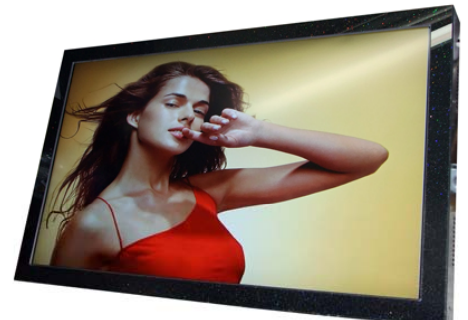
Black metal pearl bezel front frame