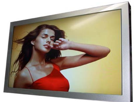
Silver pearl bezel front frame