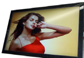
Black metal pearl bezel front frame