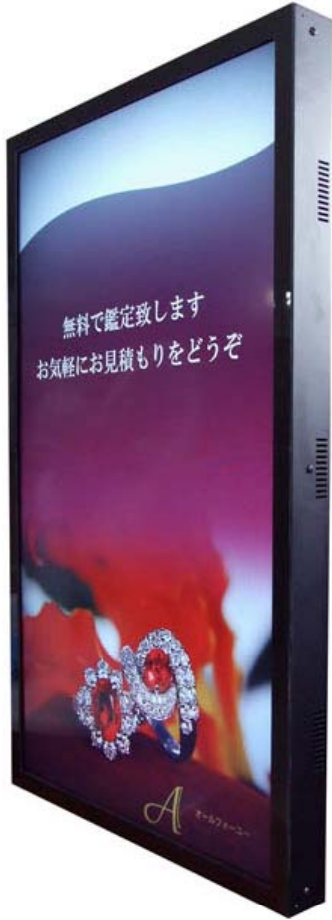
Black pearl bezel front frame