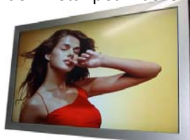
Silver pearl bezel front frame