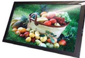
Black pearl bezel front frame